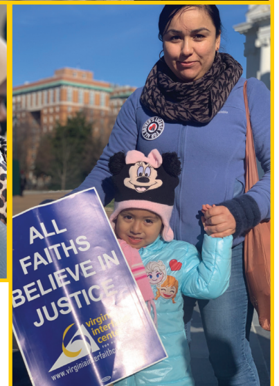
Top: Faith leaders speak out at the Capitol during Minimum Wage vigil, Feb. 19 Left: Day for All People, Jan. 22 Right: Drive Virginia Forward rally, Jan. 8