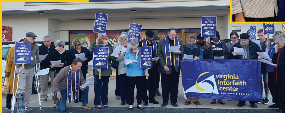
Left: Faith leaders hosted prayer vigils at payday lending stores across Virginia.