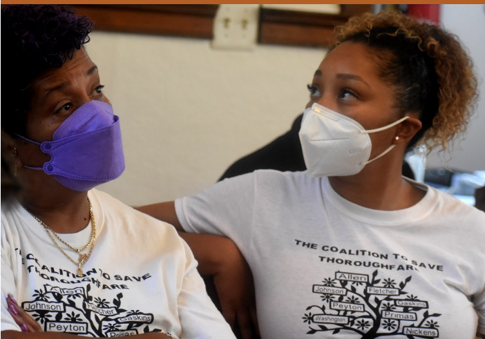
Community Meeting Oakrum Baptist Church Thoroughfare, Virginia Sunday, June 6, 2021